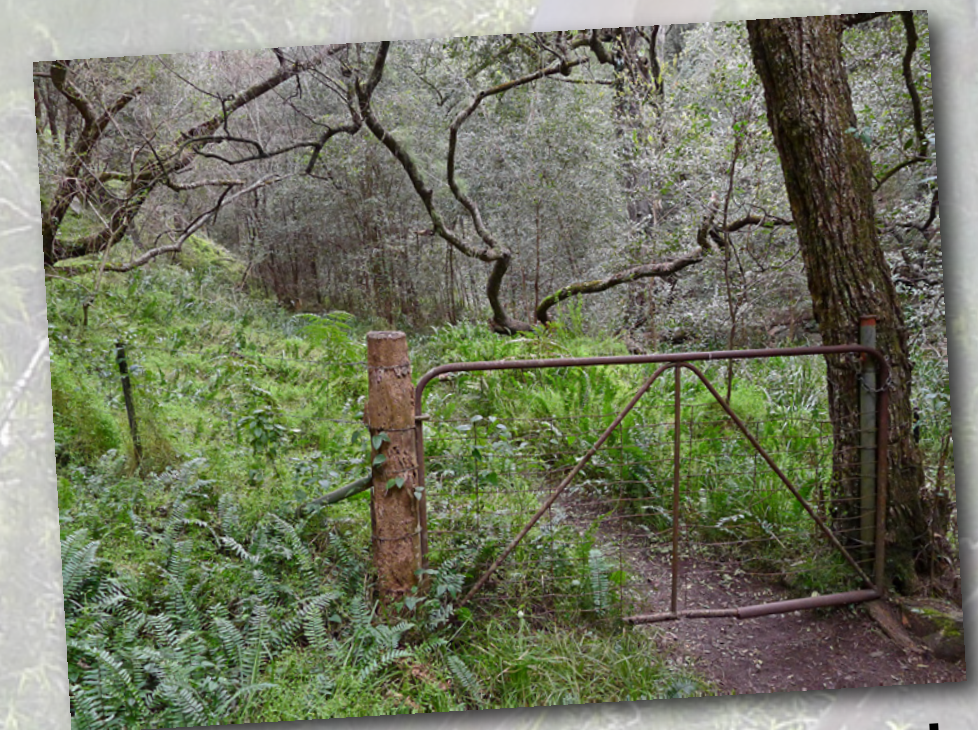
"The Gate of no apparent purpose" on Breakfast Ck