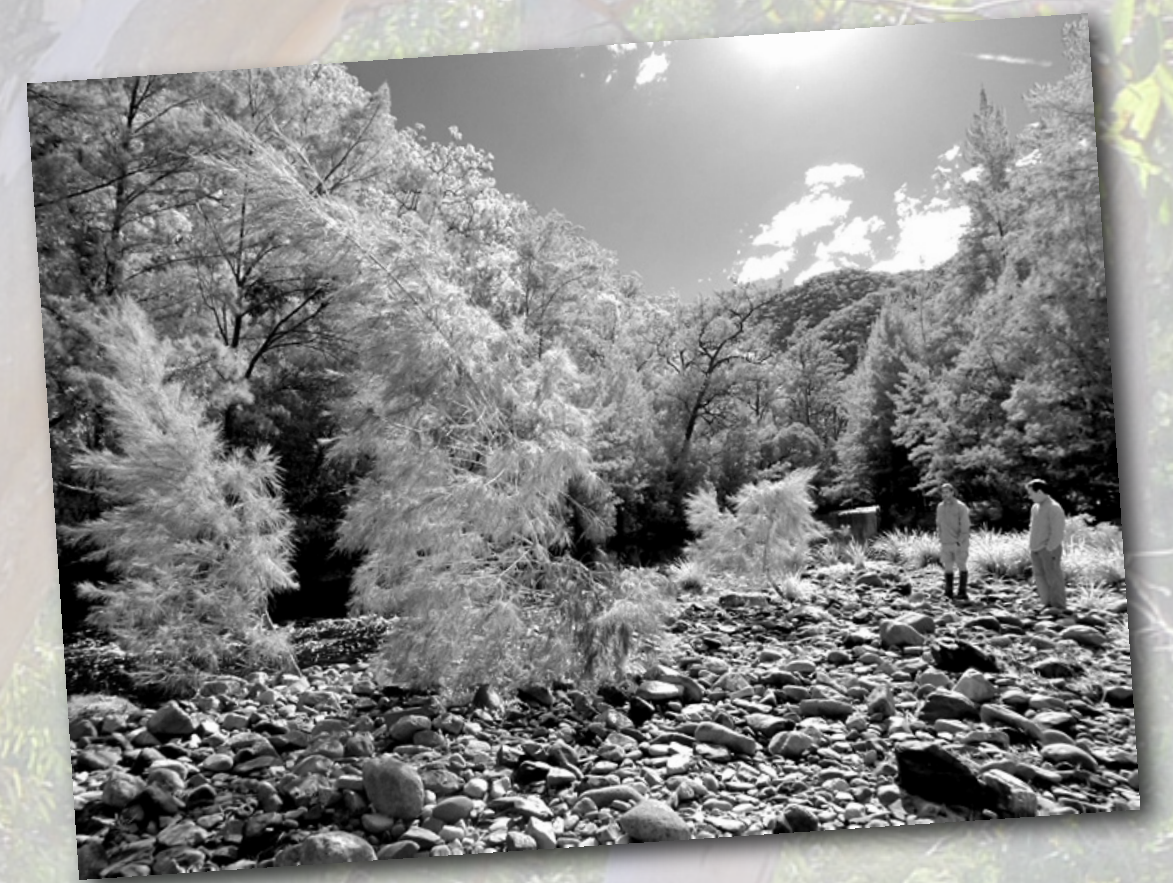
The Cox's River - it was pleasant in the sun, but not in the water