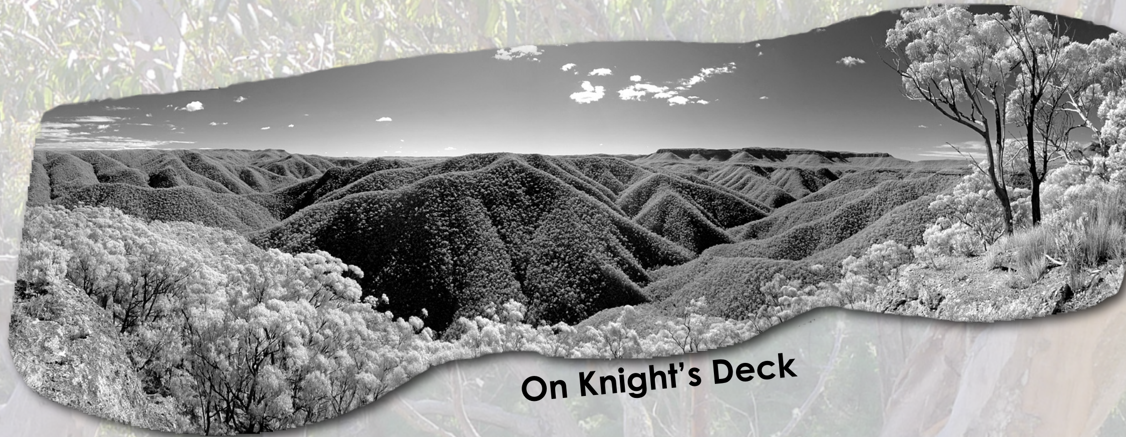
On Knight's Deck