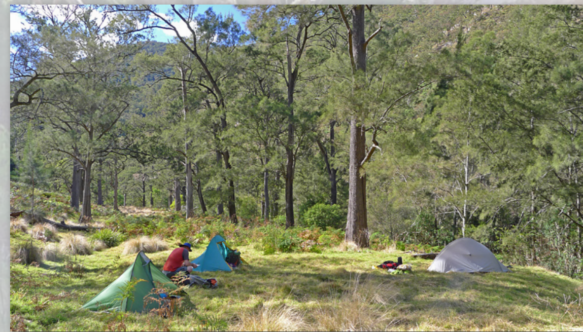
Our Cox's R. camp - near "Davy's Camp"