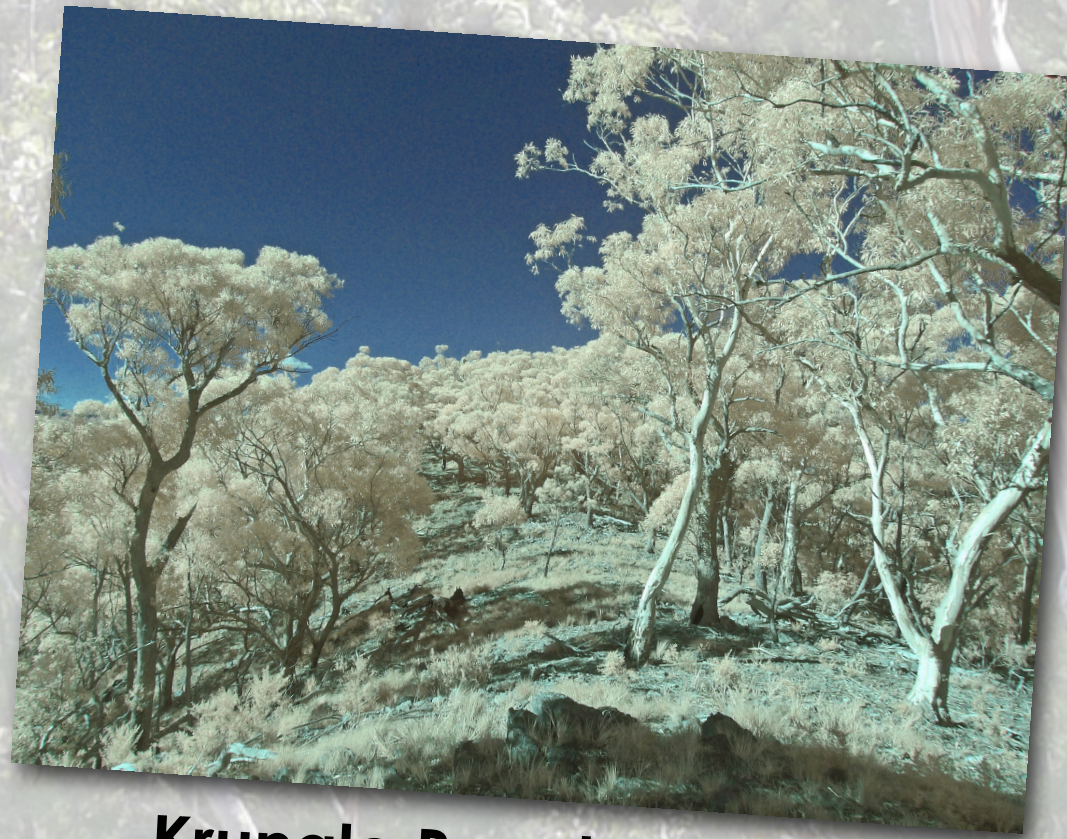
Krungle Bungle Range near Mt Jenolan