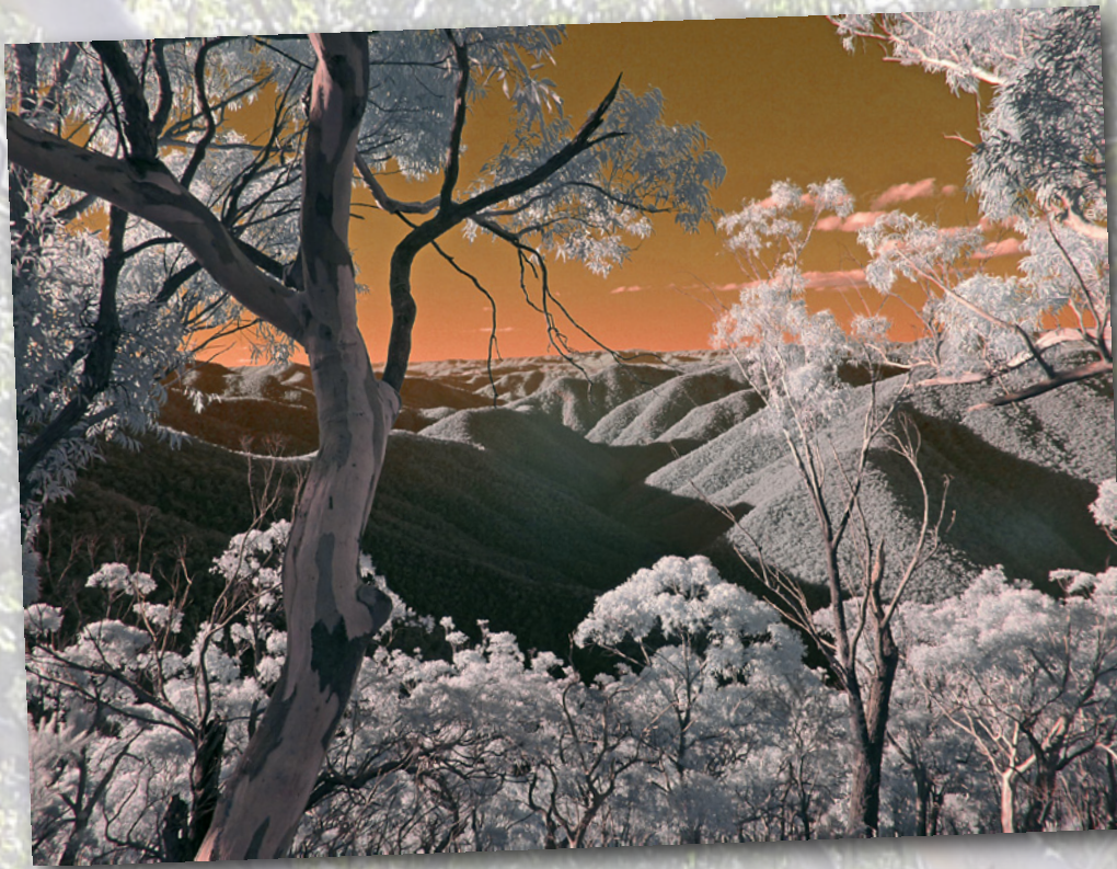
Excellent views from the Gaspers